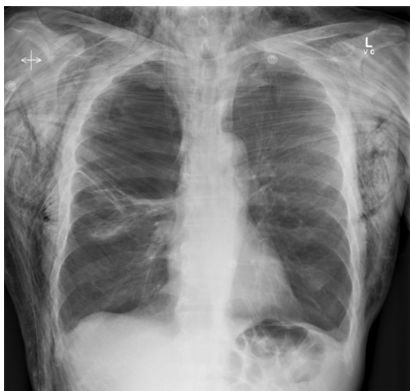
Figure 1. Serial chest x-rays in Patient 1

A. After initial decompression of a right-sided pneumothorax, x-ray showed bilateral bullous emphysema, a large right apical bulla and extensive subcutaneous emphysema.