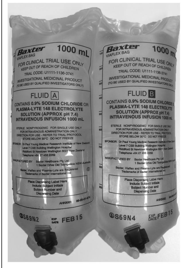
Figure 2. Masked study fluids A and B

with the assigned study fluid. Open-label study fluids will be available for use in rare situations when the treating clinician believes that there is a specific indication for either 0.9% saline or Plasma-Lyte 148, eg, for acute brain injury, when the higher sodium content of 0.9% saline may make it advantageous because it may decrease the risk of cerebral oedema. 14 Concomitant treatment with non-study specialised crystalloid solutions, colloids and blood products will be at the discretion of the treating clinician.