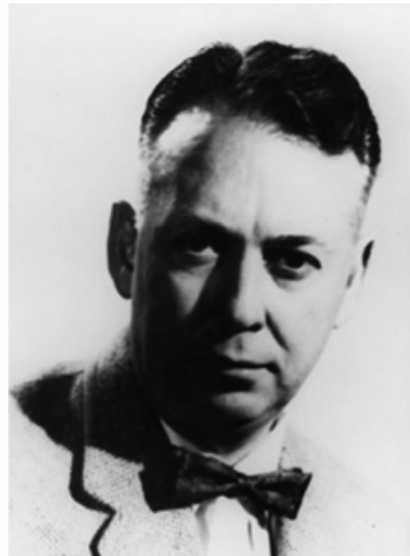
Figure 5. James Elam

In 1952, James Elam demonstrated that expired air ventilation could maintain adequate oxygenation and CO 2 excretion in anaesthetised, intubated, paralysed patients. He went on to conduct a strong campaign to have mouth-to-mouth ventilation accepted for resuscitation. (With thanks to the American Society of Anesthesiologists.) ♦