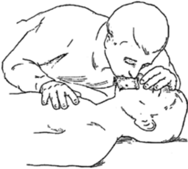
Figure 3. Waters' simple method of artificial respiration

Ralph Waters' simple line drawing of 1943 of one "simple method for performing artificial respiration". (With thanks to the American Medical Association. Reprinted from Figure 5, JAMA 1943; 123: 559-61.)