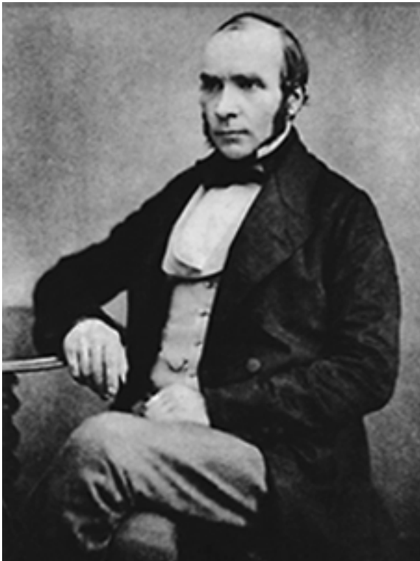
Figure 1. John Snow

In the early 1840s, when eminent personages in the Royal Humane Society dismissed artificial ventilation as of secondary importance for resuscitation from drowning, John Snow strongly argued it was the proven “measure which might be useful at a later period in asphyxia than any other”. 32 ♦