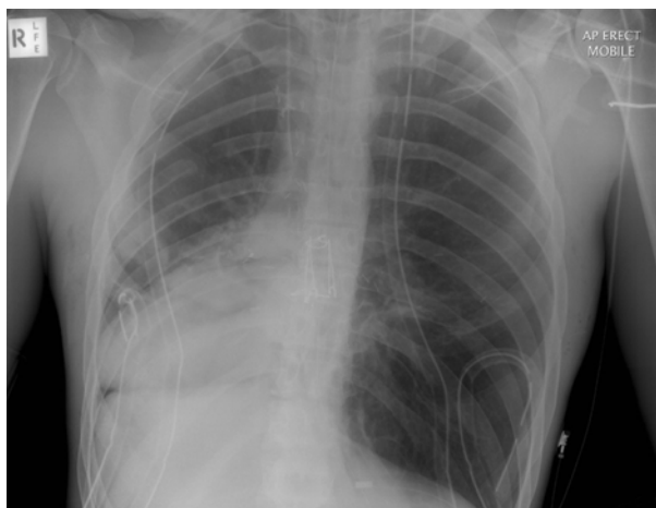
B. A postoperative chest x-ray on the patient's arrival in the intensive care unit showed evidence of acute cardiac herniation to the right with dextroversion.