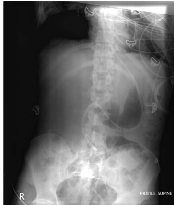
Figure 2. Abdominal x-ray to confirm catheter placement

A radiograph was taken to confirm successful postpyloric placement prior to commencement of feeds. For the study, the radiograph was independently verified by a radiologist (BF).