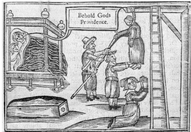
Figure 2. Anne Green's execution and recovery (with permission - see Acknowledgements)

stimulatory, plus warmth, and success was often attributed to divine providence.