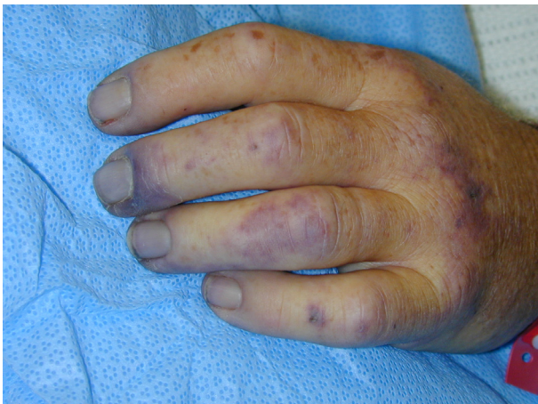
Figure 2. Circulatory compromise developing in the hands of the patient during the first 24 hours of treatment in the intensive care unit.

During the first 24 hours he required increasing doses of vasoactive agents. The circulation to both feet below the ankles showed no clinical improvement and clinically there appeared to be an impending threat to the circulation of his upper limbs (Figure 2).