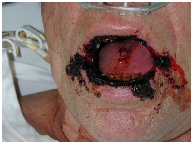
Figure 4. Oropharyngeal mucous membrane desquamation 7 days after admission to the intensive care unit.

Although the patient recovered from the haemodynamic disorder, he developed acute tubular necrosis and required further haemodialysis. He was weaned from mechanical ventilation and was extubated by the ninth day. Aortography was performed on the 10 th day