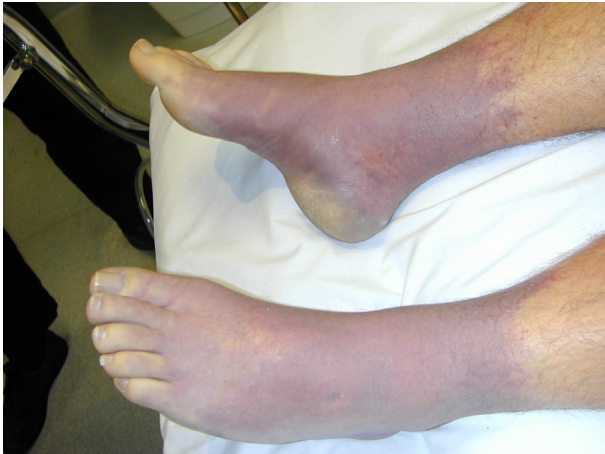
Figure 1. Severe circulatory compromise to both feet on admission to the intensive care unit.

and continuous cardiac output measurements derived from a pulse index continuous cardiac output computer (Pulsion Pacific®). Early continuous haemodiafiltration was initiated to correct the acid base and electrolyte derangements. Empirical antibiotic therapy, with specific cover against staphylococcus aureus, was prescribed using meropenem 500 mg 8-hourly and dicloxacillin 1 g 6-hourly for 72 hrs then vancomycin 1 g daily.